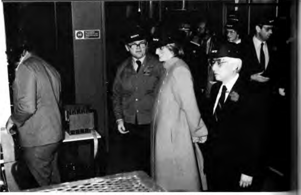
The Princess of Wales at the opening of the expanded Sony Bridgend plant in Wales.

Meeting with President Reagan at the White House during the Keidanren mission to the United States in June 1984.