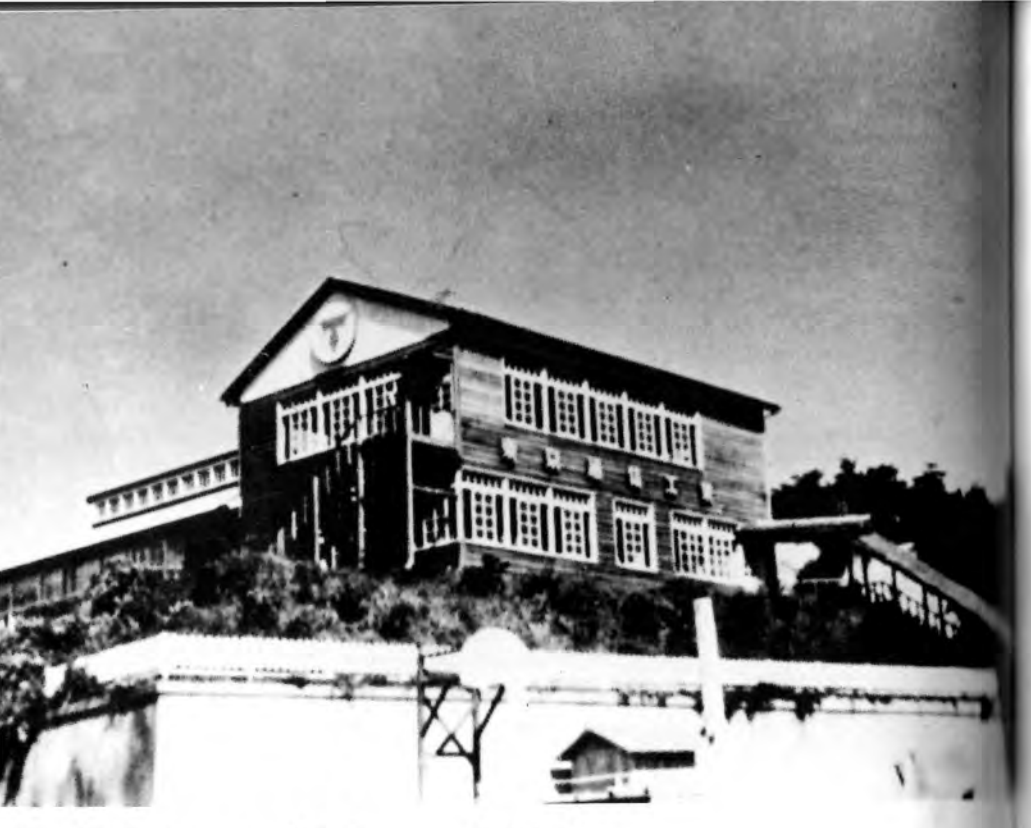
The first factory and headquarters built by Sony. The "T" stands for Tokyo Tsushin Kogyo.